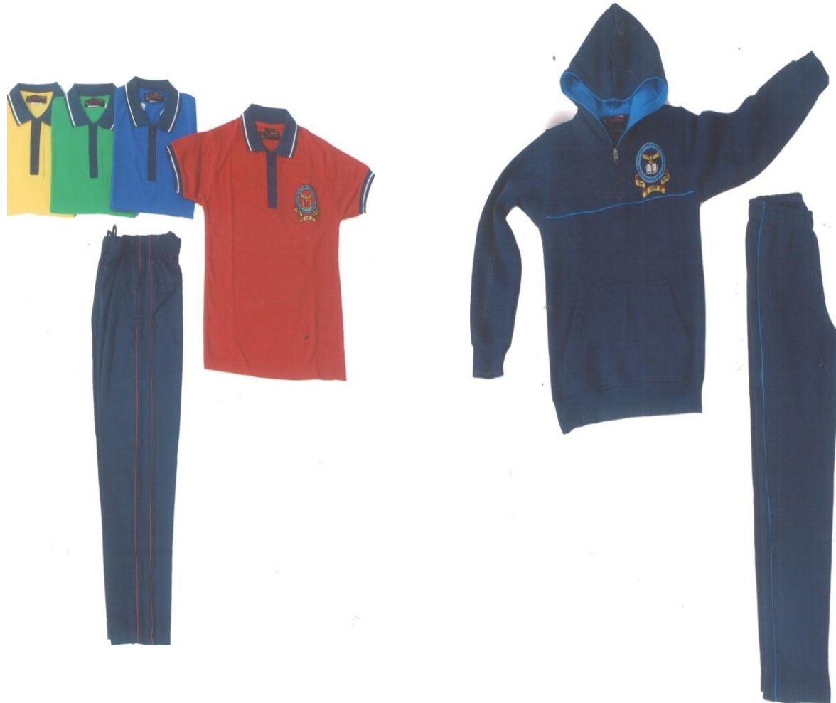
T SHIRT WITH TRACK PANT