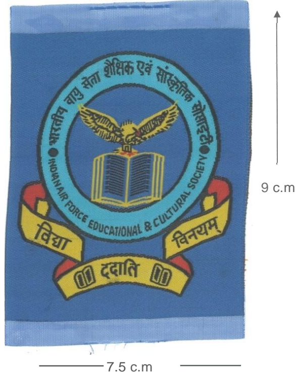
LARGE SIZE LOGO(9 CM X 7.5 CM)

FOR SECONDARY AND SENIOR SECONDARY CLASSES (IX TO XII)