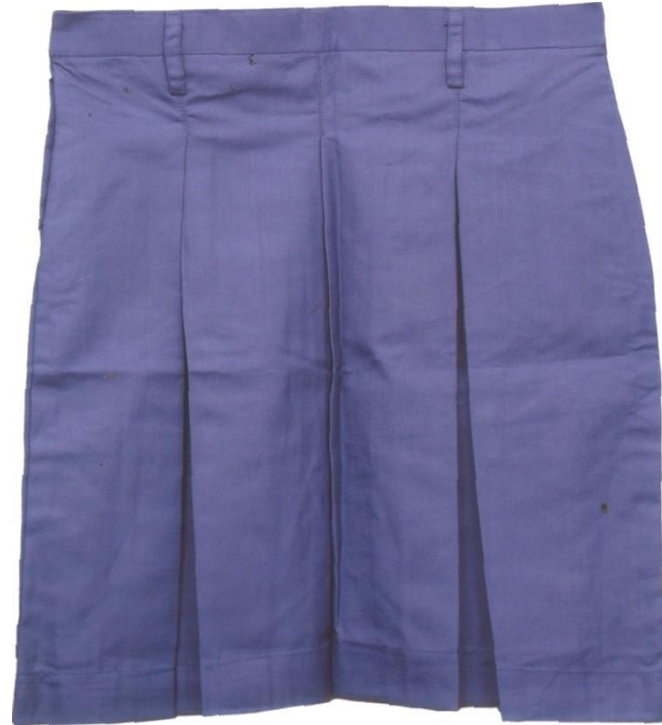
SKIRT FOR CLASS i-VIII