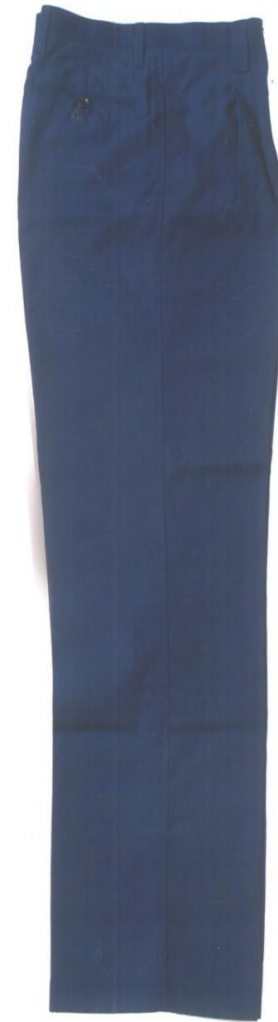
TROUSERS FOR CLASS VI-XII