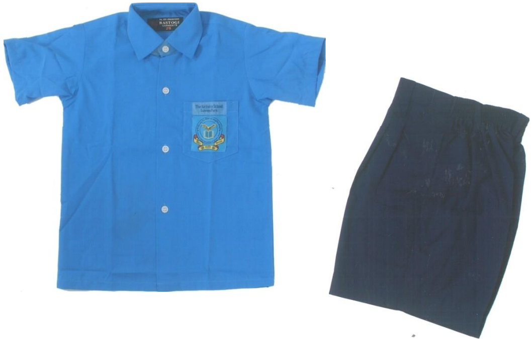
SUMMER SHIRT & SHORTS FOR PRE-PRIMARY & PRIMARY CLASSES (LKG TO V) SMALL SIZE LOGO (7CM X 6CM)