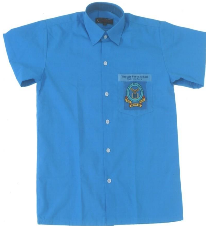
SHIRT FOR CLASS VI-XII LOGO (7.5 CM X 7 CM) FOR MIDDLE CLASSES LOGO (9 CM X 7.5 CM) FOR SEC & SR SEC CLASSES