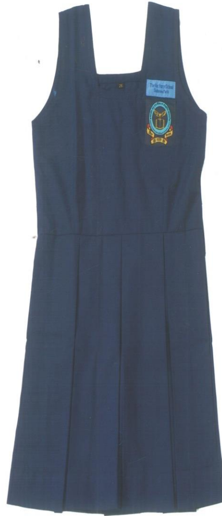
TUNIC FOR LKG/UKG [ LOGO (7 CM X 6 CM) ]