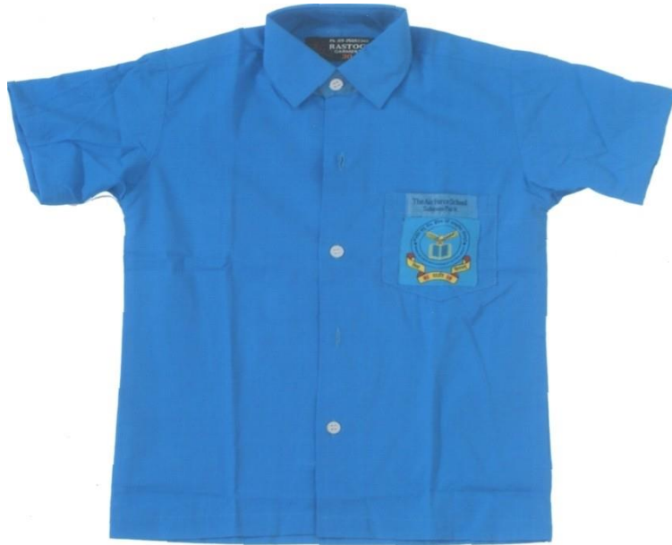
SHIRT FOR CLASS I-VIII LOGO (7 CM X 6 CM) FOR PRE-PRIMAR Yst PRIMARY CLASS ES (LKG TO V) LOGO 7.5 CM X 7 CM FOR MIDDLE CLASSES VI TO VIII