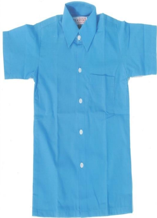
SHIRT FOR LKG/UKG